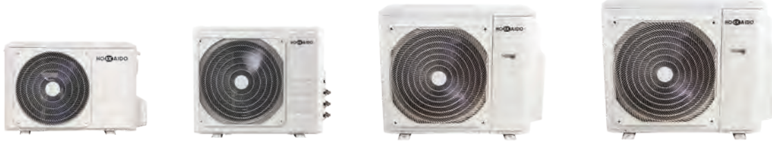
HCKU 470 Z2 HCKU 530 Z2